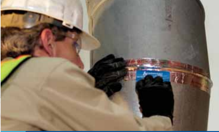
The superior sealing capabilities of Hardcast's rolled mastic sealants offer an efficient means to increase your value to your customer.